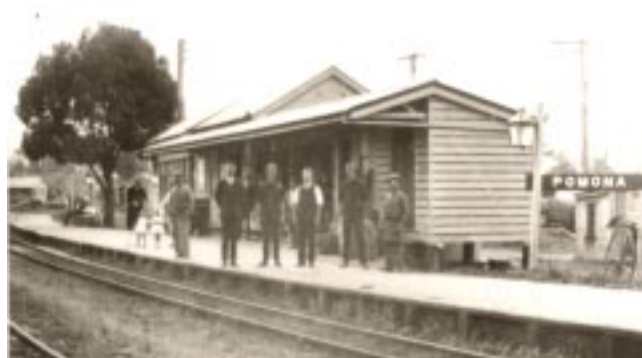
Railway workers at Pomona Station about 1927

The origins of Pomona are linked to the development of the railway. The North Coast line from Brisbane to Yandina was extended to Cooran via Pomona in 1891. Cooroora was the residents' first preference for the station's name. However, the Queensland Railway Department objected, claiming that with Cooroy and Cooran already in existence, another station beginning with Coo would be too confusing. Because it was primarily a fruit growing district at that time, the new station became known as Pomona after the Roman Goddess of Fruit.