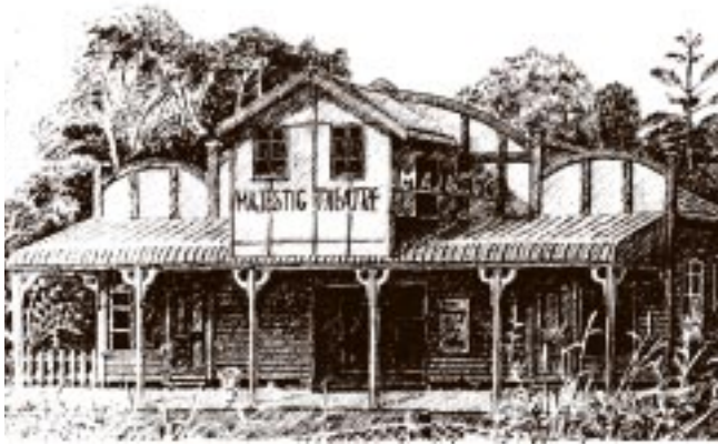
The Majestic, drawn by Kees Pel about 1984