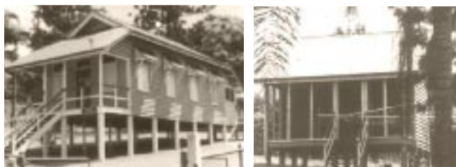
Pomona Courthouse . . . and the dreaded lock-up

The Court House was built in 1934. Before then, cases were heard in the Memorial Hall. The Magistrate's Court moved to Noosa in 1987. This Court House still has a civil jurisdiction covering Cooran, Cooroy, Kin Kin, Pinbarren, Cootharaba and Tinbeerwah. It handles births, deaths and marriages, small debt claims, business name applications and pre-poll voting.