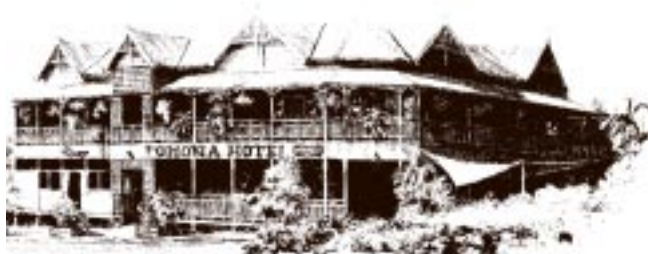
The Pomona Hotel