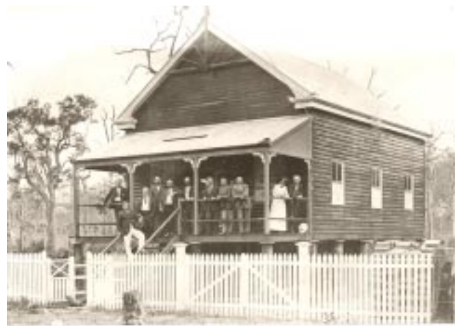
The opening of the first Noosa Council Chambers, built in 1911

One room is dedicated to the original inhabitants of the Noosa Shire, the Gubbi Gubbi people. The remainder feature social history and industry exhibits. The society holds a wonderful collection of historic photographs, most of which can be reproduced for purchase. Opening hours are displayed on a sign at the front of the building.