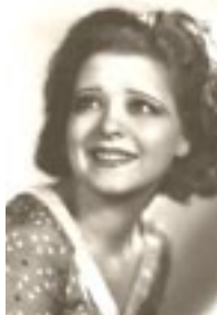
Twenties favourite Clara Bow

The Son of the Sheik, starring Rudolph Valentino is shown every Thursday night, and the theatre is open for group bookings by appointment (phone 5485 2330).